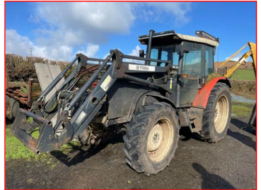
David Brown 1690 Tractor (A91 MJ7) Weights Not Included