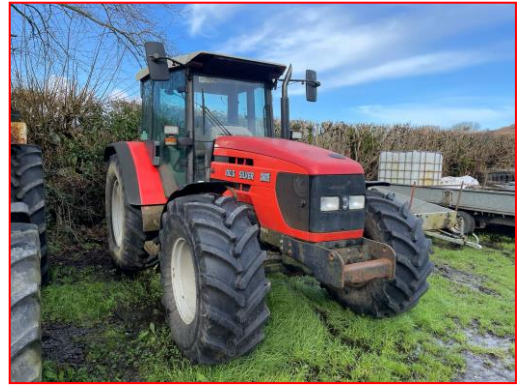
Same 100.6 4WD Tractor (N214 UNT) c/w Trima 360 loader