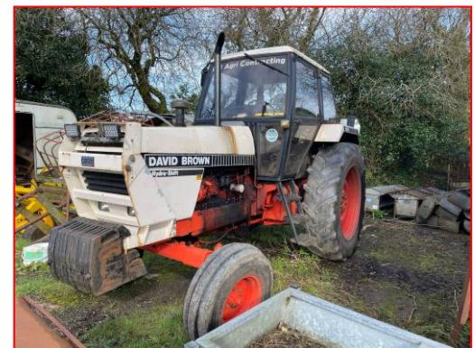
David Brown 950 Tractor (MPR 950)